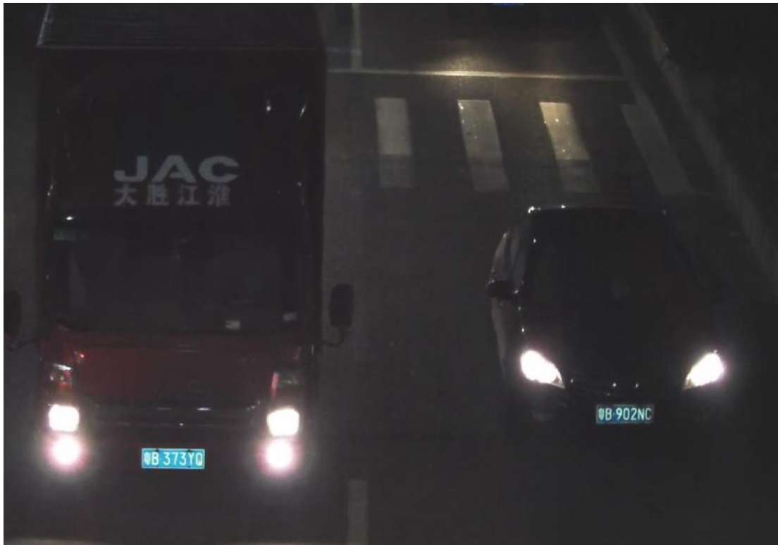
80km/h vehicle passing effect