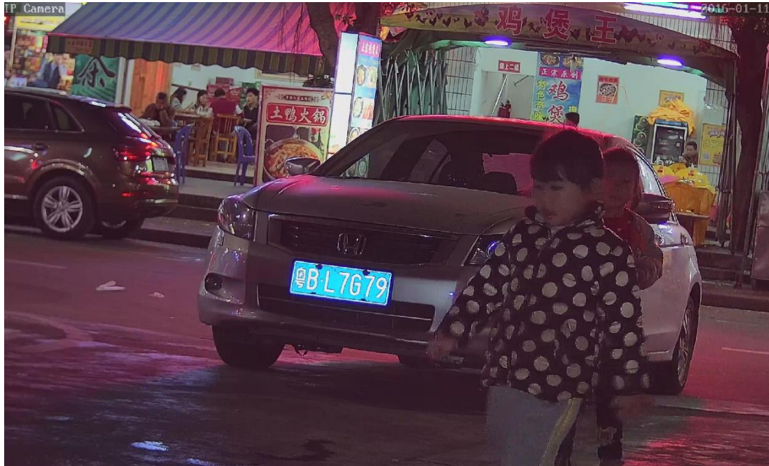
15 kilometers per hour, lights off