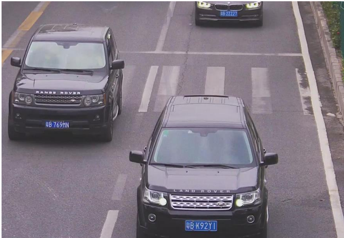
Daytime real-time video screenshot

Global Sources Homepage Address: http://www.globalsources.com/ideacamera.co