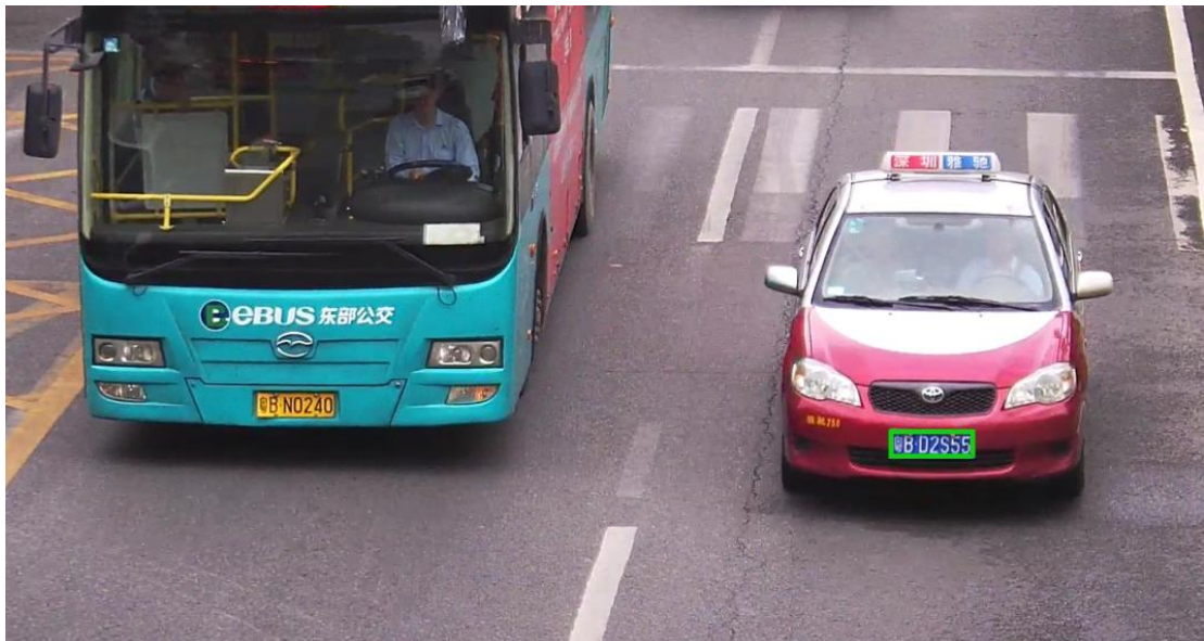
80 km/h License Plate Recognition Capture