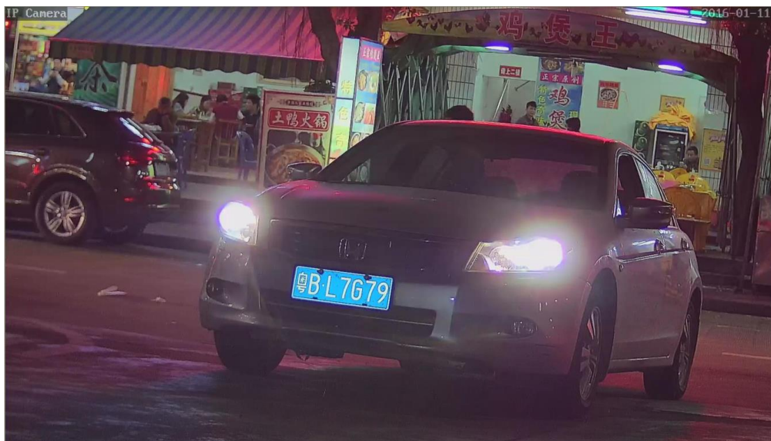
Speed of 15 kilometers per hour, high beam open